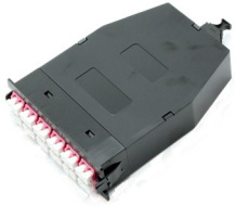
1xMPO-12xLC Dx Modular