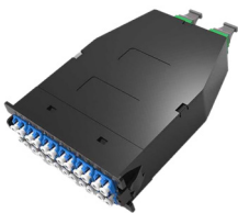
2xMPO-12xLC Dx Modular