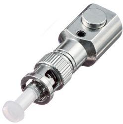
Oval body 1