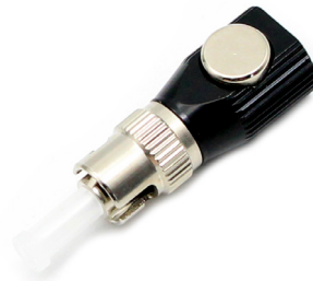
Oval body 2