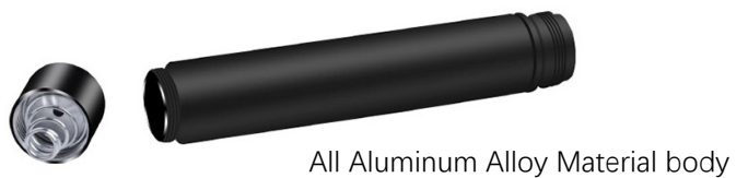
Metal 2.5mm port Laser